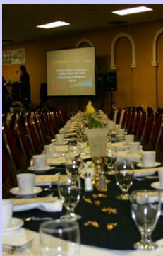
Tables set up waiting for guests