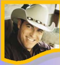
GEORGE CANYON PROFESSIONAL VOCALIST